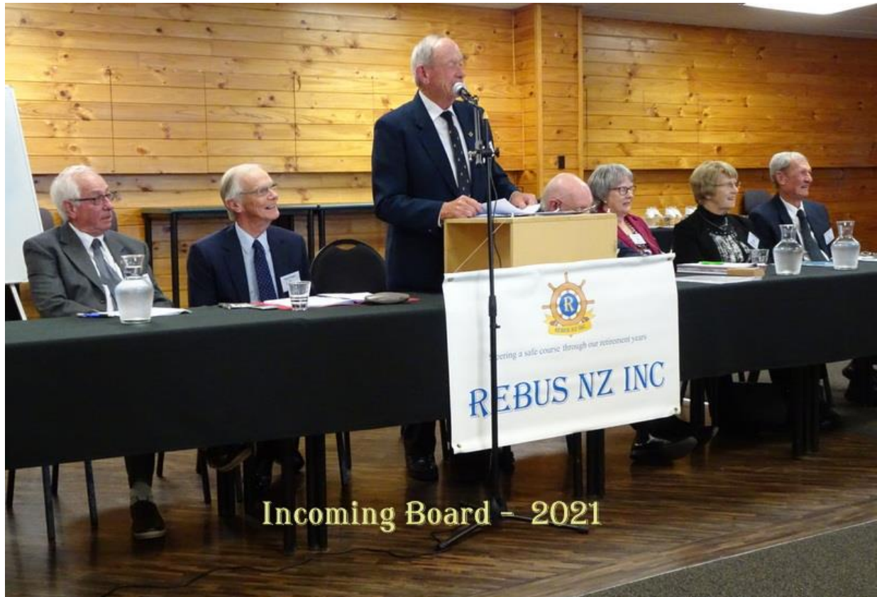
Incoming Board – 2021